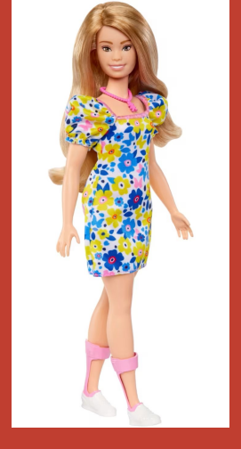
Image Above on right: Barbie with Down Syndrome with long dark blond hair, a flowered dress and short pink braces on her lower legs.

Released as part of this year's global Barbie Fashionistas lineup, Barbie partnered with the American Foundation for the Blind (AFB) to introduce a Barbie doll who is blind, joining an ever increasing group of Barbie Fashionistas featuring dolls with a variety of appearances and differing abilities.