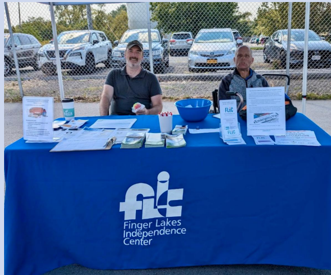
Image Above: A photo with 2 men sitting at a table with a blue table covering with the FLIC logo on it. On the table are pamphlets, pens, and other papers.