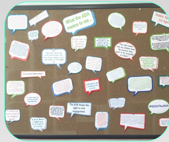
Above: "What the ADA Means to Me" Display. Below: Pledge table where over 60 people sat to recommit to the ADA.

On the 29th of July more than 60 people stopped in to FLIC to sign the ADA Anniversary Pledge. For more information and to pledge to recommit to the full implementation of the ADA visit: www.adaanniversary.org